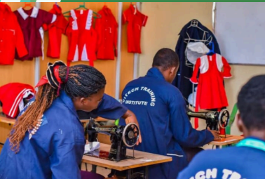
Fashion & Design